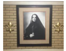
New entry to our parochial Mother Cabrini Academy!