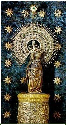
The history of Nuestra Senora del Pilar as related by Mary of Agreda

Jesus, speaking to Holy Mary, said: “My most beloved Mother, I desire that thou go to Saragossa where my faithful servant James now is, and command him to return to Jerusalem. But before he leaves that city, he is to build a temple in thy name and title, where thou shalt be venerated and invoked for the welfare of that country, for My glory and pleasure, and that of the most blessed Trinity.”