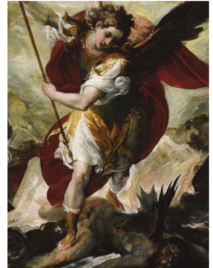
Saint Michael the Archangel, defend us in battle!

A great sign appeared in heaven: A woman clothed with the sun, and the moon under her feet, and on her head a crown of twelve stars . . . And there was seen another sign in heaven: and behold a great red dragon . . . his tail drew the third part of the stars of heaven, and cast them to the earth: and the dragon stood before the woman who was ready to be delivered; that, when she should be delivered, he might devour her Son. And she brought forth a man child, Who was to rule all nations . . . And there was a great battle in heaven, Michael and his angels fought with the dragon, and the dragon fought and his angels: and they prevailed not, neither was their place found any more in heaven. And that dragon was cast out, that old serpent, who is called the devil and Satan, who seduceth the whole world; and he was cast unto the earth, and his angels were thrown down with him. And I heard a loud voice saying: Now is come salvation, and strength, and the kingdom of our God, and the power of his Christ . . . And when the dragon saw that he was cast unto the earth, he persecuted the woman, who brought forth the man child . . . And the dragon was angry against the woman: and went to make war with the rest of her seed, who keep the commandments of God, and have the testimony of Jesus Christ.